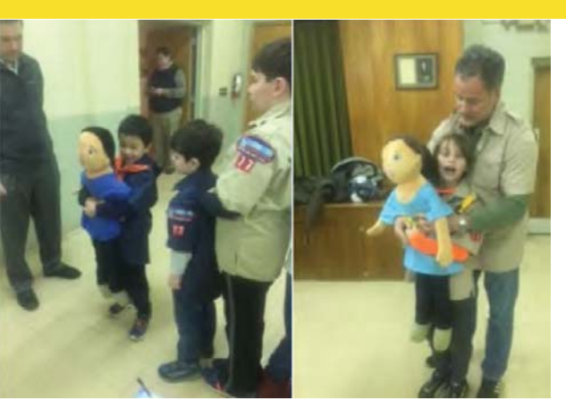
Practice Makes a Lasting Impression